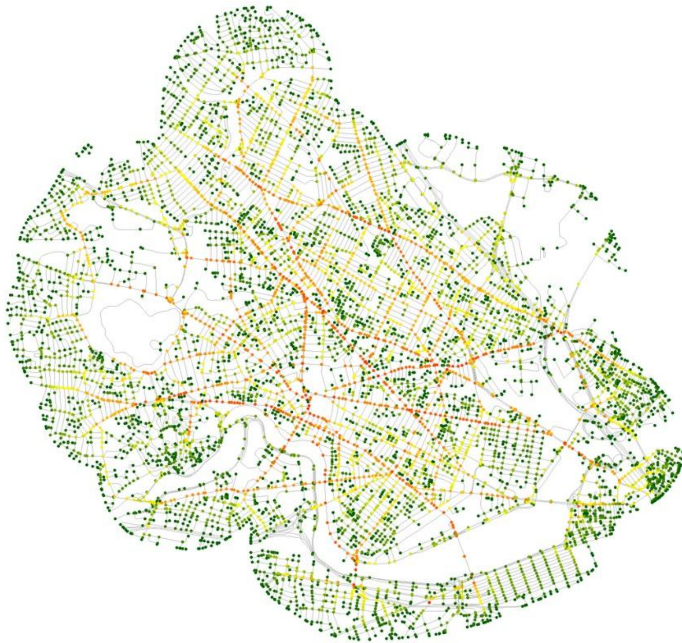
Betweenness of street intersections in Cambridge and Somerville, MA.